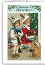
“Now Christmas is come Let’s beat up the drum, and call all our neighbor’s together.”

playing; running between houses and in the fields. You will see, you will see how good it will be in the year to come.”